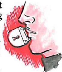
PRIEST'S LIPS LOCKED

A priest must always keep his lips locked about what he hears in confession. One priest even died a martyr's death, because he refused to reveal what he had heard in confession. His name was St. John Nepomucene.