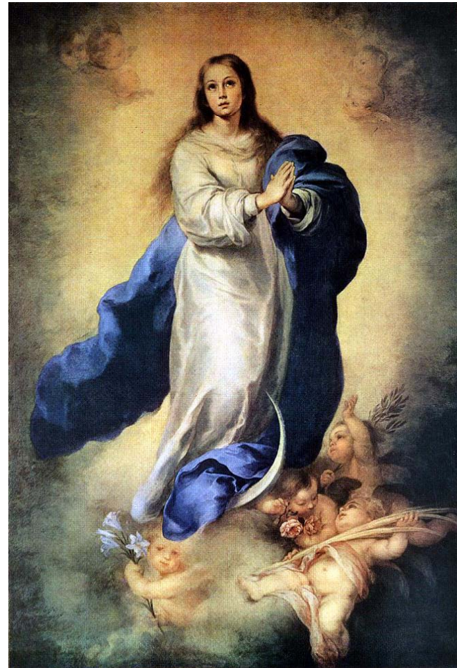
The Immaculate Conception by Murillo, 1660, Museo del Prado, Spain.